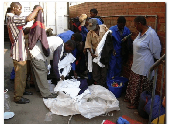
Tops, candles and soap >