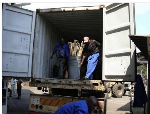
Tools & dustbins >