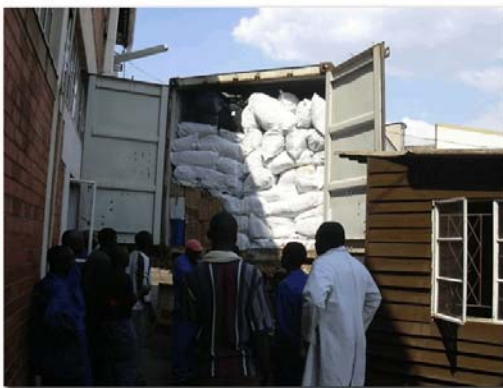
< The doors of the container open!