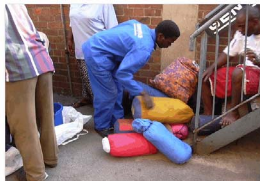
< Sleeping Bags