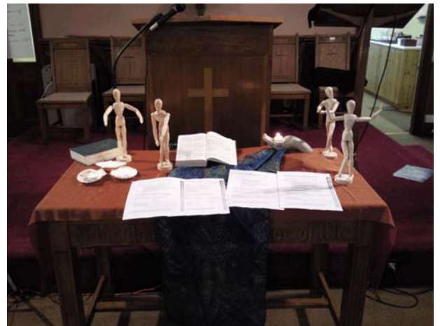
The angels & letters to the church in Tavistock

Let anyone who has an ear listen to what the Spirit is saying to the churches.