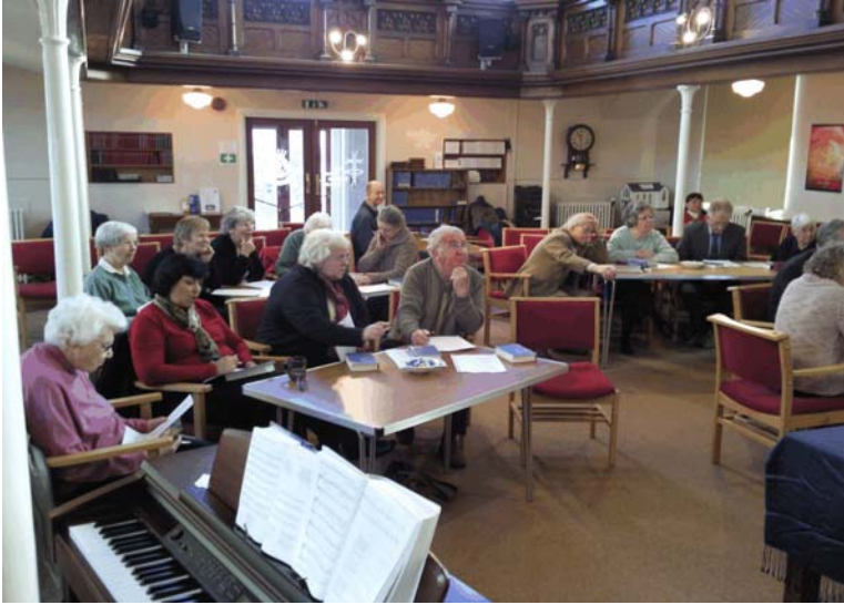
Everyone's concentrating hard!