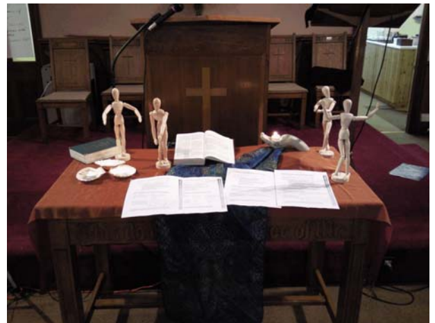
The angels & letters to the church in Tavistock

Let anyone who has an ear listen to what the Spirit is saying to the churches.