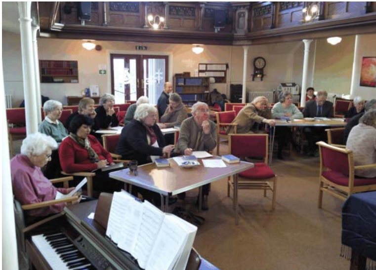
Everyone's concentrating hard!